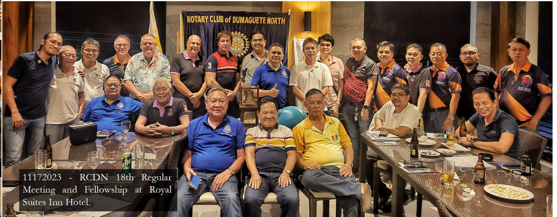
11172023 - RCDN 18th Regular Meeting and Fellowship at Royal Suites Inn Hotel.